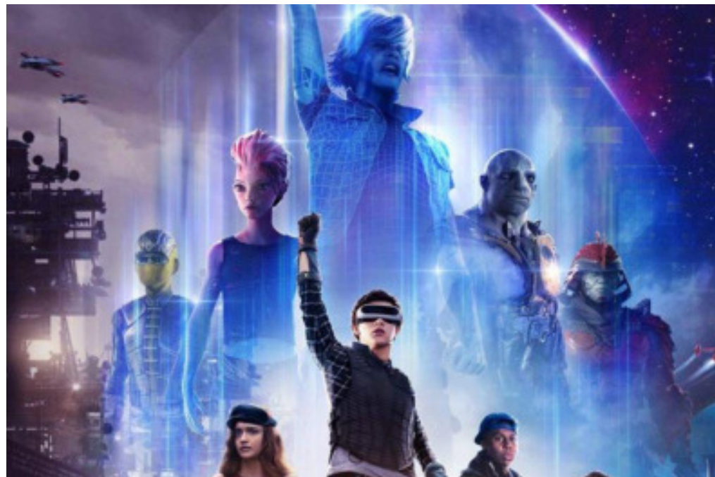
Ready Player One

"metaverse" was originally coined by science fiction writer Author Neal Stephenson in his 1992 science fiction novel "Snow Crash," in which he envisioned lifelike avatars who met in realistic 3D buildings and other virtual reality environments. The concept was further given creative stimulus in the Steven Spielberg movie in 2018, Ready Player One . Many of the metaverse projects today owe